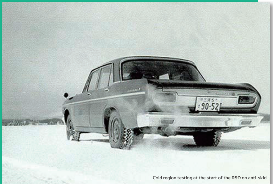
Cold region testing at the start of the R&D on anti-skid