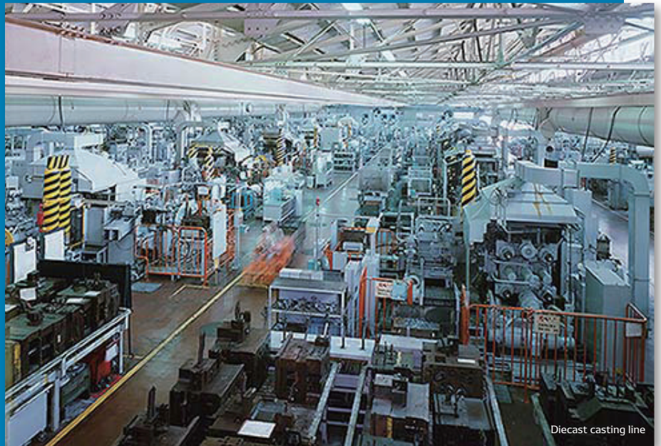
Diecast casting line