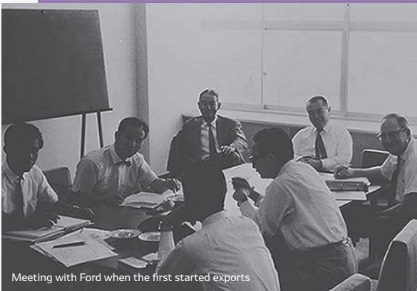
Meeting with Ford when the first started exports

Japan joined the OECD in April 1964. The open economic system of Japan advanced greatly. With regard to how DENSO ought to deal with the trade liberalization for passenger cars, the opinions of all managers were consolidated and in August, a "New Management Policy in Embarking on an Open Economy" (subsequently renamed as the "Open System Guidelines") was formulated. Therefore, the company declared that "DENSO will turn global. We will move resolutely towards this goal. This is the mission of all our employees. And the one and only way that our employees can achieve happiness. This is what we believe".