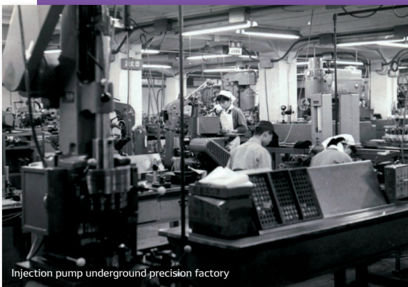
Injection pump underground precision factory

Precision processing technology is inseparable from fuel injection devices that require a high-pressure airtightness. In 1955, Toyota Motor Corporation announced the development of a diesel vehicle, and DENSO signed an additional technical assistance agreement on injection pumps with Robert Bosch. In August 1955, an injection pump preparation room was set up in the Production Engineering Division, and in November of the same year, an injection pump area was newly established to further develop it, starting research and trial production of the injection pump. Our commitment to precision processing technology thus began in this way.