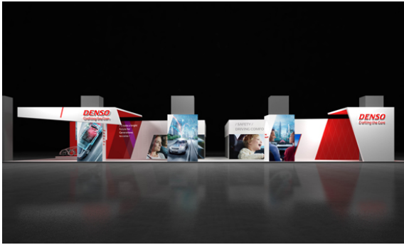
DENSO booth image